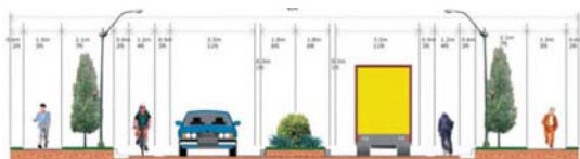
Preliminary Preferred Alternative South Third Street – Central Segment