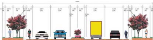
Preliminary Preferred Alternative Russell Street – North Segment